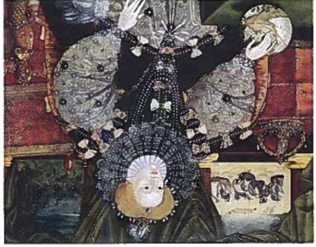
Two Speeches by Queen Elizabeth I

Directions: Read the speeches by Queen Elizabeth I. As you read, highlight examples of persuasive language. Then, answer the questions that follow.